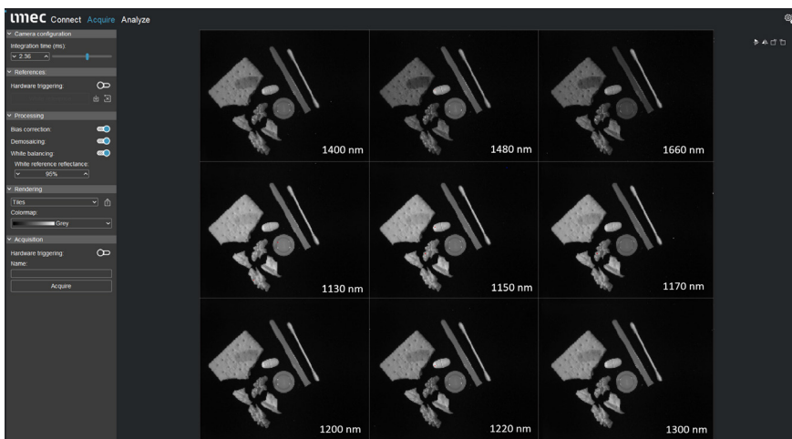
Hyperspectral imaging acquisition software of imec: several objects (dry and wetted cake, plastic PET and PVC, nuts and their shell) are shown in the SNm3x3 = 9 spectral colors tiled view. The HSI data-cube can be classified in real-time at 200+ FPS (see next page)